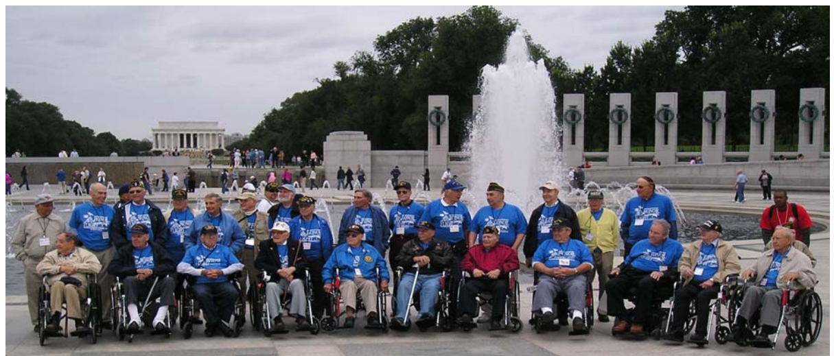
Honor Flight to WWII Memorial in Washington DC