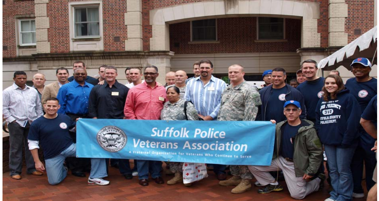
Walter Reed Army Medical Center Washington, DC