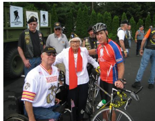
SOLDIER RIDE 2009