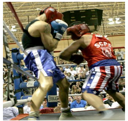
HEROES FOR HEROES BOXING EVENT